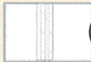
Hidden Screw Posts